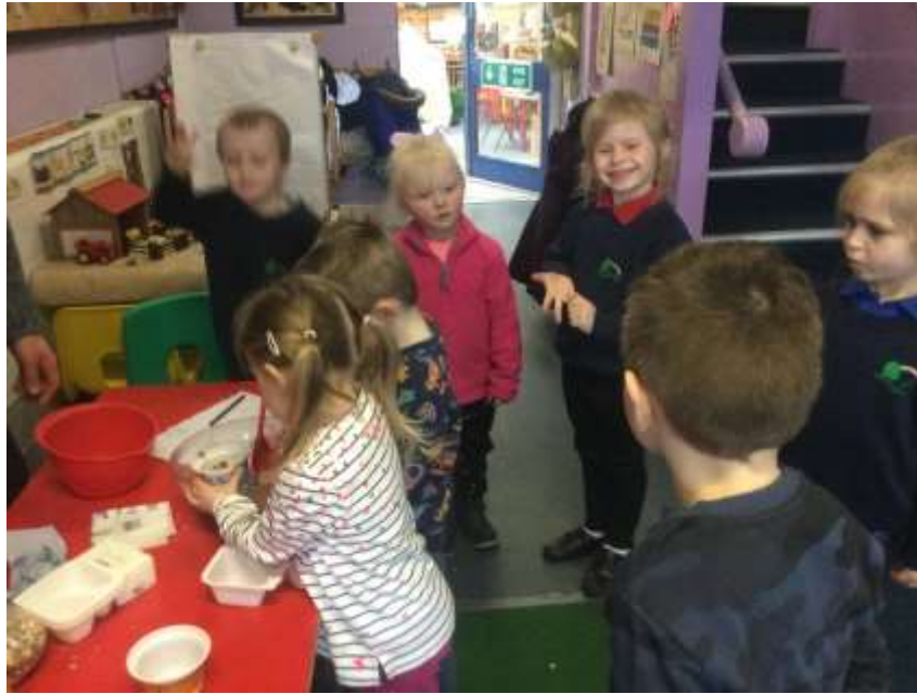
Children baking in the Nursery